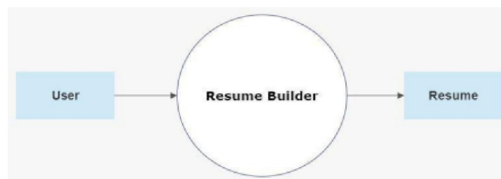
Fig 1: Dataflow Diagram for Level 0

It is an application that simplifies the task of creating a resume for individuals. The system is flexible to be used and reduces the need of thinking and designing an appropriate resume according to qualifications. The system is developed to provide an easy means for creating a professional looking resume. Individuals just have to fill up a form that specifies questions from all required fields such as personal questions, educational, qualities, interest, skills and so on. The answers provided by the users are stored and the system automatically generates a well structured resume. Users have option to create resume in any format and file.