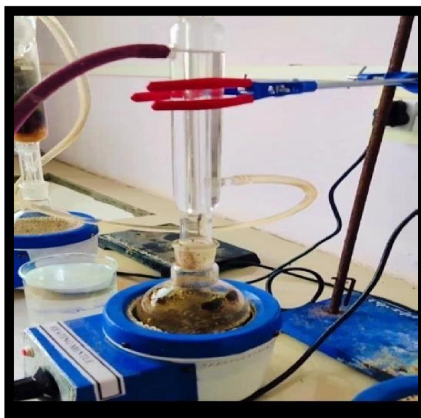
Figure: Plant extraction

Iyengar yoga focuses on holding poses and using props (blocks, belts, chairs, and blankets) to suit different physical capacities. Other yoga types exist, and the experience in one style or class might be extremely different from the experience in another. The Yoga can range in intensity from light to severe, with some styles focusing on a cardiovascular workout and others on relaxation and peace. Another sensory element is the yoga facility itself, which can foster a sense of social and spiritual connection. Yoga's popularity has skyrocketed during the last few years. The Centres for Disease Control and Prevention's (CDC) National Health Interview Survey results suggest a growth in the use of complementary and alternative medicine (CAM) treatments [19]. Yoga was the seventh most popular complementary and alternative medicine therapy in 2007. CAM therapies are most commonly utilised to treat musculoskeletal problems, such as back pain and, to a lesser extent, neck discomfort.