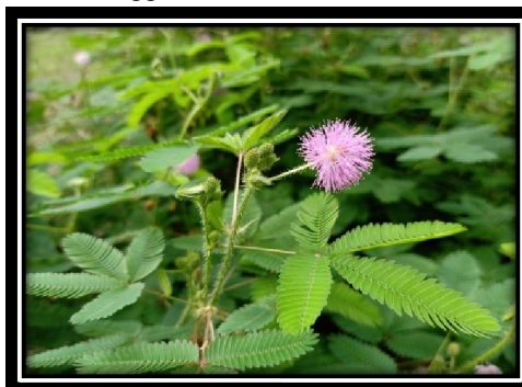
Figure: Mimosa pudica L.

Mimosa pudica L. (Mimosaceae) also referred to as touch me not, live and die, shame plant and humble plant is a prostrate or semi-erect subshrub of tropical America and Australia, also found in India heavily armed with recurved thorns and having sensitive soft grey green leaflets that fold and droop at night or when touched and cooled. It majorly possesses antibacterial, antivenom, antifertility, anticonvulsant, antidepressant, aphrodisiac, and various other pharmacological activities. The herb has been used traditionally for ages, in the treatment of urogenital disorders, piles, dysentery, sinus, and also applied on wounds.