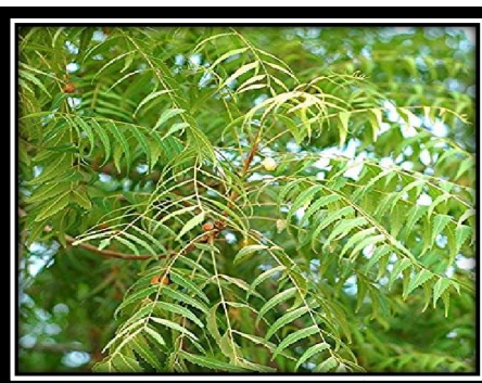
Figure: Azadirachta indica A.