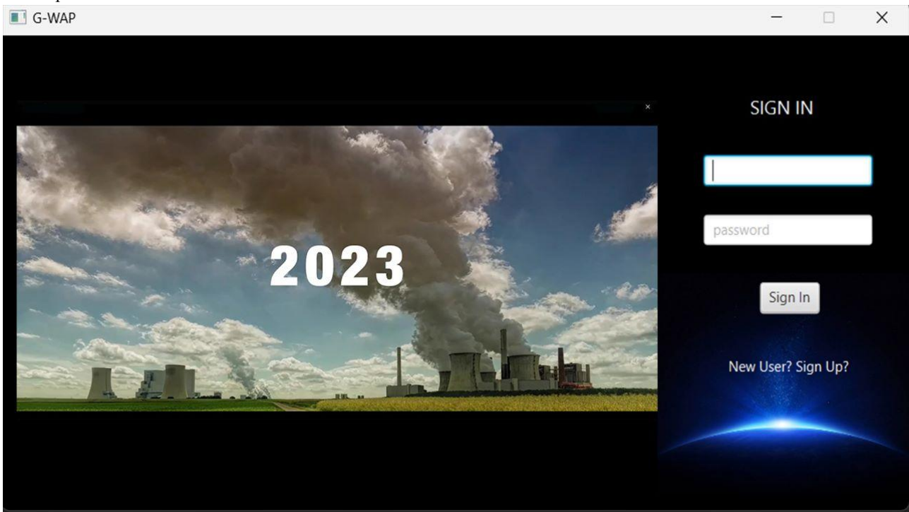
Figure 4.1: Login Page

In this user can do registration by entering his/her details like first name, last name, phone number, username, password and address. By doing this Registration user will be registered in our database and is ready to login OR Sign in to our Desktop Portal.