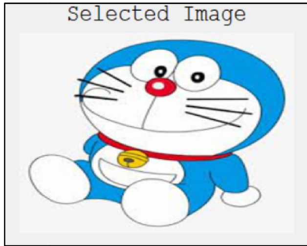
Fig 4.2 Data inserted into an image