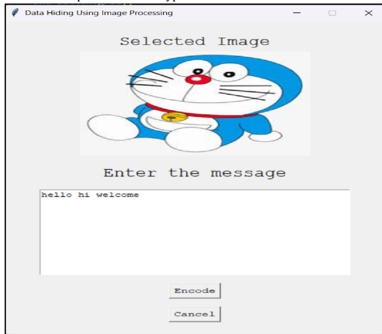
Fig 4.1 Input for the encryption

The encrypted image will be taken to perform the decryption module.