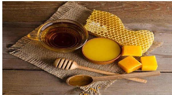
Fig 5: Beewax