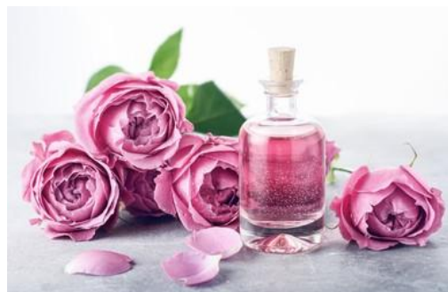
Fig 6: Rose Water

Rose water is especially hydrating when combined with other moisturizing ingredients, such as ceramides or glycerin. “These help to moisturize the skin, protect the skin barrier and prevent further water loss from the skin,” says Allawh. However, it shouldn't replace your current moisturizer. Rose water has been used as a beauty product for thousands of years, so it's no surprise that it can improve your complexion and reduce skin redness. The antibacterial properties may help reduce acne. The anti-inflammatory properties can reduce skin redness and puffiness. Rose Water Maintains the Skin's Natural pH Balance. Chemically produced soaps and cleansers disrupt the pH balance of our skin, making it prone to bacteria that cause various skin conditions like rashes and acne. This property helps rose water restore the skin to its normal pH level