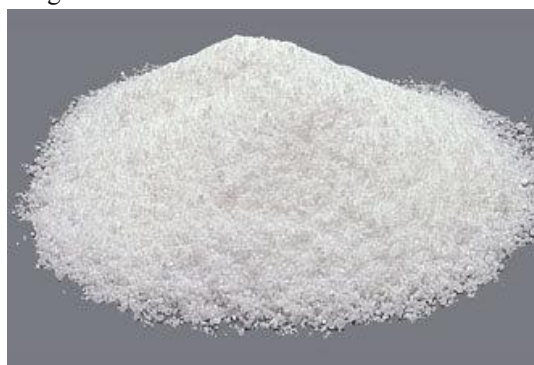
Fig 4: Borax

Borax, combined with wax, is used in many cosmetic products like creams, gels, and lotions. It is famously used in hand soaps to help wash off the oil or grease from the hands. Borax's alkaline nature makes it a perfect ingredient in cleansers and toners. In cosmetic products, borax is sometimes used as an emulsifier, buffering agent, or preservative for moisturizing products, creams, shampoos, gels, lotions, bath bombs, scrubs, and bath salts. Borax is also an ingredient combined with glue and water to make “slime,” a gooey material that many kids enjoy playing with. Right from creams and body lotions to shampoos, bath gels and even the in-vogue bath bombs, just about every product associated with skincare has Borax as one of its components. Given its mild and antiseptic nature, quite a few natural cosmetic products tend to include Borax as an essential ingredient as well.