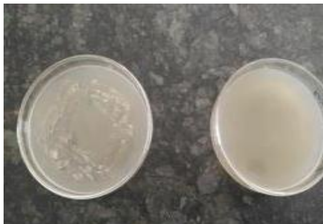
Fig 8: Microbial Growth