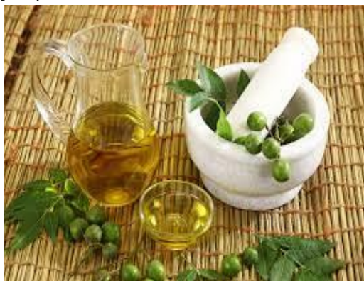
Fig 3: Neem Oil

Neem oil is a naturally occurring pesticide found in seeds from the neem tree. Neem oil is a mixture of components. Azadirachtin is the most active component for repelling and killing pests and can be extracted from neem oil. The portion left over is called clarified hydrophobic neem oil