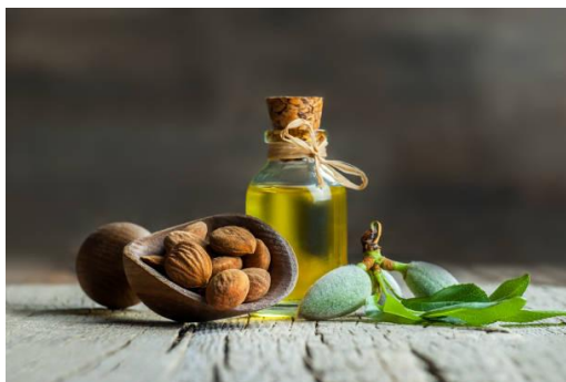
Fig 2: Almond Oil

It's also anti-inflammatory and boosts immunity. Containing omega-3 fatty acids, almond oil might help you maintain healthy cholesterol levels and improve your memory. It may help lower your risk for diseases like cancer and heart disease.