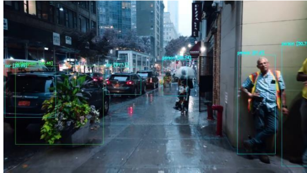
The above screenshot gives us an overview of how YOLOv4 detects objects.