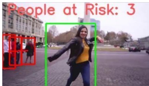
The above screenshot gives us an overview of how the social distance detection system works.