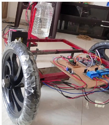
Figure 3: Solar base grass cutting machine