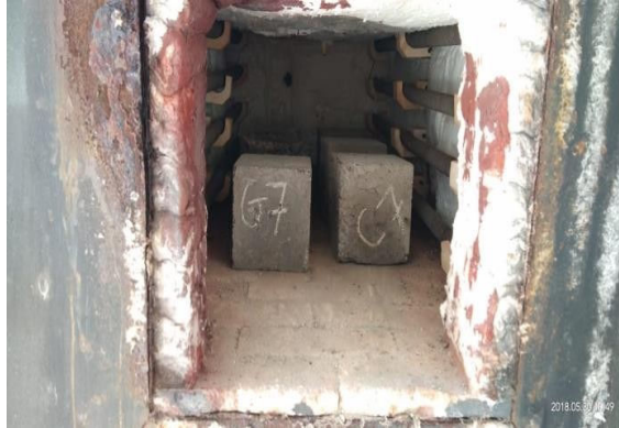
Figure 2: Concrete Specimens kept in furnace for checking temperature effect

The increase in temperature results in water evaporation, C-S-H gel dehydration, calcium hydroxide and calcium aluminates decomposition, etc. Along with the increase in temperature, changes in the aggregate take place. 'Due to those changes, concrete strength and modulus of elasticity gradually decreases, and when the temperature exceeds ca. 300°C, the decline in strength becomes more rapid. When the 500°C threshold is passed, the compressive strength of concrete usually drops by 50% to 60%, and the concrete is considered fully damaged [8].