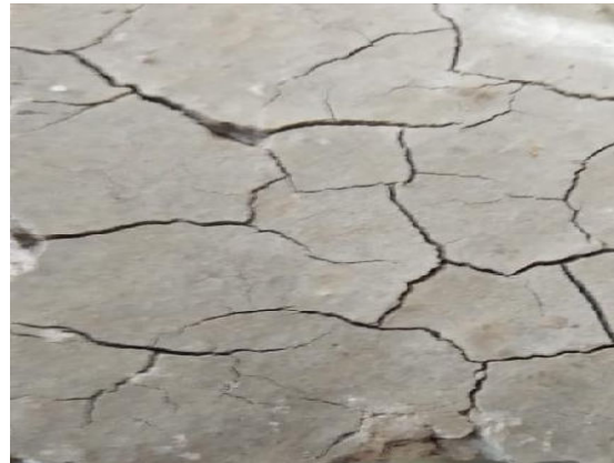
Figure 3: Concrete surface cracks after exposed to 700°C