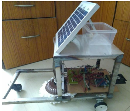
Figure 2: Project Hardware