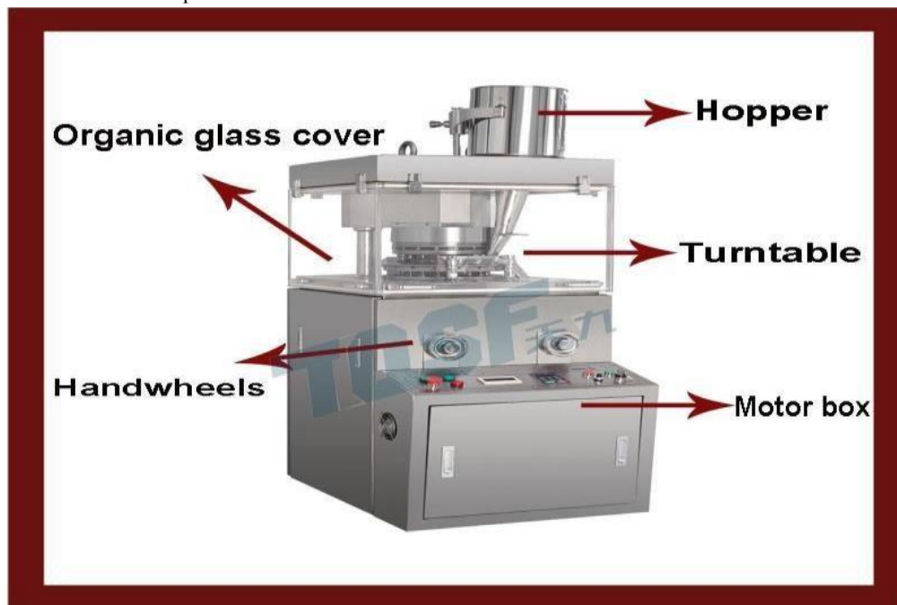
FIG 1 - HIGH SPEED ROTARY TABLET PRESS MACHINE