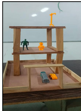
Fig 2: Prototype construction site model developed for PPE detection testing.

The proposed AI-Based PPE Detection System was successfully designed and implemented for construction site safety monitoring. The system was tested using a prototype construction model and real-time object detection software integrated with a live camera feed. The developed model was capable of identifying workers with and without Personal Protective Equipment (PPE) such as helmets and safety vests in real time.