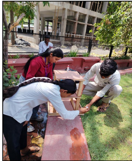
Fig 3: Real-time AI object detection dashboard showing PPE and non-PPE worker detection

The prototype model also validated the practical applicability of the system in construction environments. The AI model accurately differentiated between workers wearing helmets and workers without PPE. The generated alerts and visual detection outputs proved useful for proactive accident prevention and safety compliance monitoring.