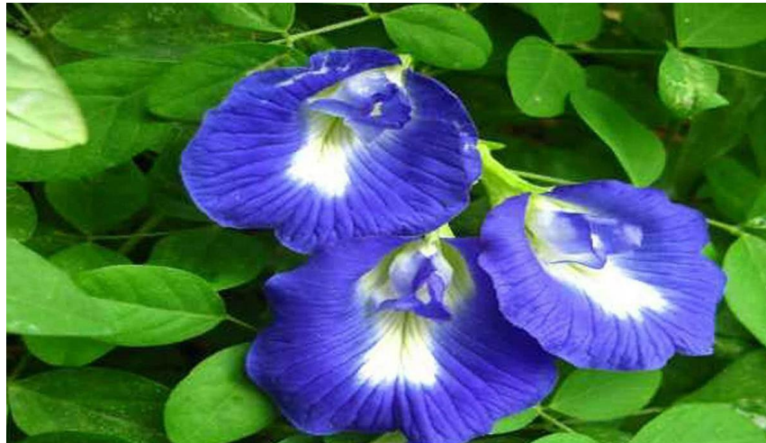
Fig no.4 Clitoria Ternatea

Native to tropical Asia, Widely found in India , Shri Lanka, Southeast Asia, Africa and Australia.