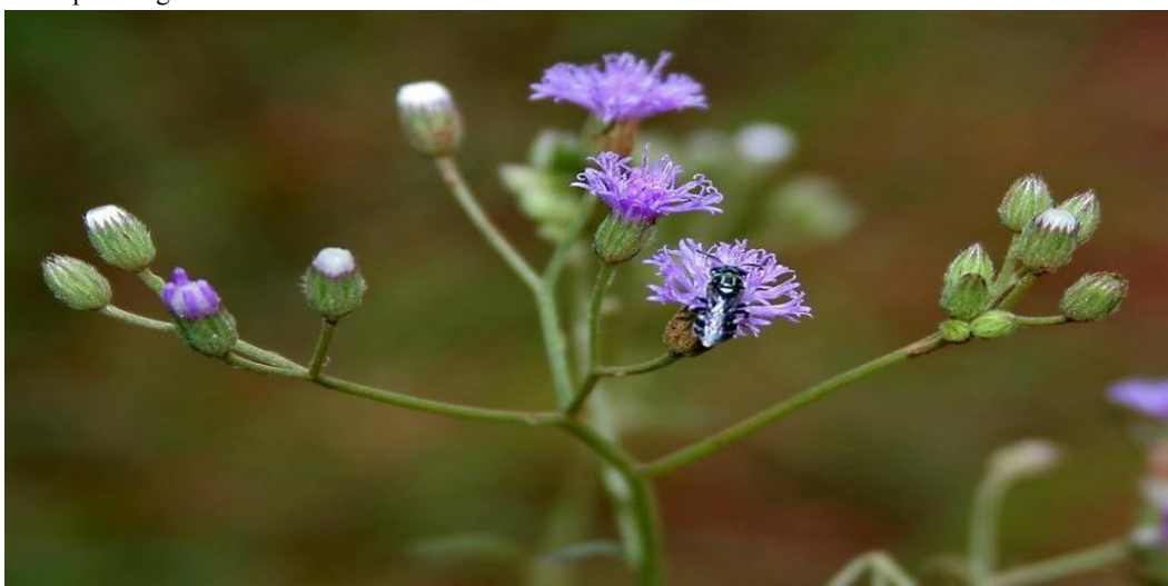
Fig no.5 Cyanthillium cinereum

Native to tropical Africa and Asia (India, Sri Lanka, Southeast Asia), Widely Naturalized in Australia, South America, and other Tropical regions.