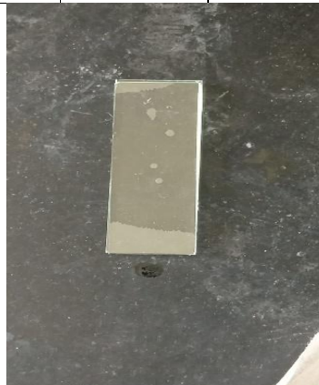
Figno.8: Spreadability test