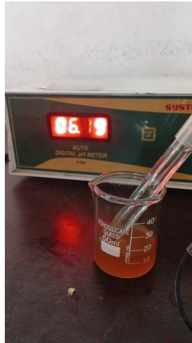
Fig no.6: pH test