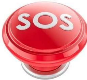
Fig 4: SOS button

The SOS button is a critical safety feature that allows the user to send an emergency alert instantly. When pressed, it triggers the ESP32 to send location details and alert messages to authorities and guardians for immediate assistance.