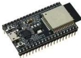
Fig 2: ESP32

The ESP32 acts as the brain of the system, managing data processing and communication. It receives GPS data, monitors the SOS button, and controls alert mechanisms. With built-in Wi-Fi and Bluetooth, it enables seamless connectivity to cloud platforms and ensures efficient real-time operation with low power consumption.