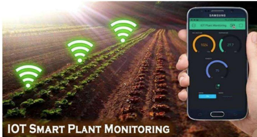
Fig. 2. Cloud Platform

revolutionize water management practices and promote sustainable agriculture and landscaping. The complete hardware setup and cloud platform are shown in Figures 4 and 5 respectively.