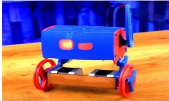
Fig.3 Picture of the Bot

Building a self-balancing robot using an MPU6050 sensor offers a wealth of valuable outcomes. Beyond the immediate thrill of seeing, it defies gravity, the project serves as a powerful demonstration of key concepts in feedback control, sensor fusion, and microcontroller programming. This hands-on experience fosters essential skills in problem-solving, electronics, mechanics, and coding, laying the groundwork for further exploration in advanced control algorithms, additional functionalities, and integration with other technologies. It's not just about building a robot; it's about igniting a passion for learning, creativity, and innovation, ultimately paving the way for exciting advancements in the field of robotics and its potential applications