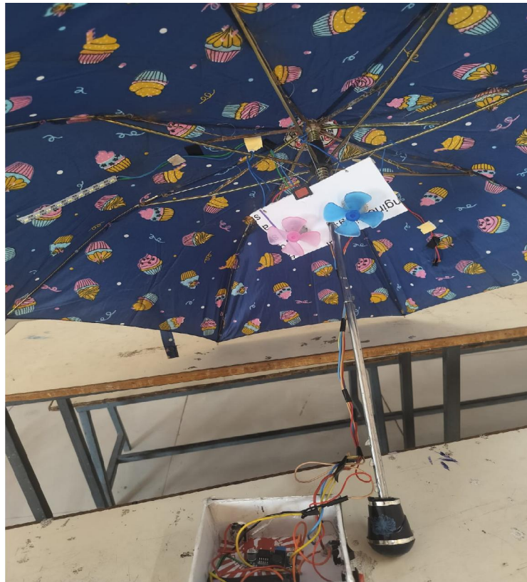
Fig 3 : Final assembled monitoring system

The final assembly of the solar-powered multi-utility umbrella is designed to ensure compactness, portability, and efficient utilization of solar energy in real-world outdoor conditions. The solar panel is securely mounted on the top surface of the umbrella canopy at an energy tilt angle to maximize sunlight exposure throughout the day. The central pole of the umbrella is utilized as the main structural support as well as a pathway for internal wiring, ensuring a neat and protected arrangement. A rechargeable battery, along with a charge controller, is housed in a weatherproof enclosure attached near the base or mid-section of the pole to maintain balance and stability.