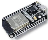
Fig. 2 ESP32 Microcontroller

ESP32 acts as the central control unit of the system. It processes sensor data, detects faults, and controls protection devices. It offers high processing capability and supports wireless communication for future enhancements.