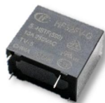
Fig. 5 Circuit Breaker

The circuit breaker is used to interrupt the current during fault conditions and protect the system from damage. Here we are using SSTs to simulate the circuit breakers