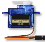
Fig. 6 Micro Servo Motor

The isolator is used to disconnect the faulty section for maintenance and safety. It operates only after the circuit breaker opens.