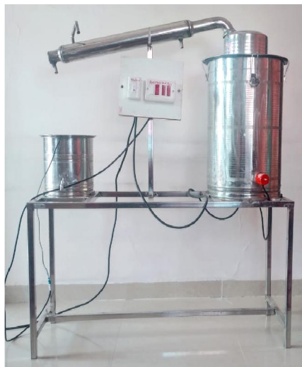
Fig. 1 Experimental Setup of Steam Distillation Unit

The diagram of experimental setup is shown below. The experiment was conducted in a Stainless Steel Extraction Unit. It consist of one round steel drum of dome shape structure capacity of 50 lit approx which have heating coils inside to heat , which is then connected with steel pipe which goes through one end of condenser which is used for cooling the formed steam and then from other end of condenser the water droplet receiving pipe is connected from which cooled water droplet is goes and collected in collecting drum. The thermostat is also used for measurement of rising temperature of boiling unit And cooling water unit is separated connected at bottom side which supplies continuously cooled water to condenser for cooling the steam. this unit is connected to condenser from two point, one is input and other is output. From input point the cooled water is supplied to condenser to cool down the steam and from output point the heated water is collect out in cooling Drum, then this heated water is again get cooled in cooling drum and it again supply to condenser, this process is happen continuously. The separating funnel is used for the separation of essential oil and extract water.