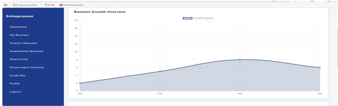
Fig 1: Entrepreneur Dashboard

The following screenshots represent the actual implementation of the proposed system