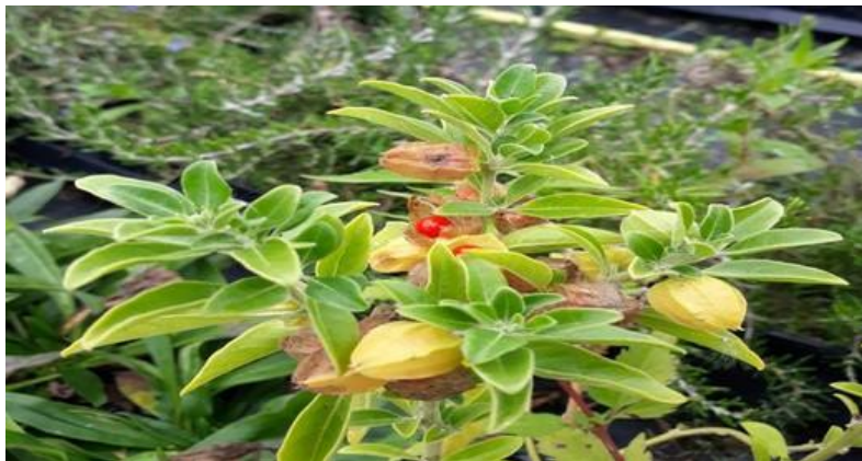
Fig 1. Ashwagandha

Taxonomical Classification Kingdom: Plantae, plants Subkingdom: Tracheobionta, vascular plants; Super division: spermatophytes, seed plants; Division: Angiosperm Class: Dicots Order: Tubiflorae Family: Solanaceae Genus: Withania Species: Dunal somnifera