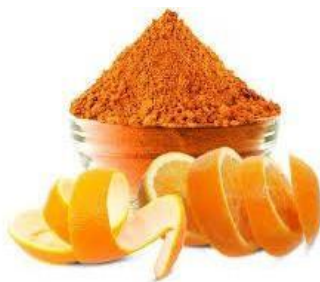
Figure No.3 Orange Peel Powder