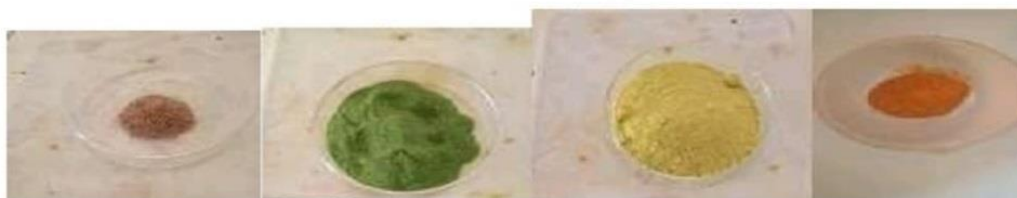
(A) Nutmeg Powder, (B) Neem Powder, (C) Orange Peel Powder, (D) Turmeric Powder

All Ingredients were accurately weighted using an analytical balance to ensure precision in the formulation. Turmeric Powder and nutmeg powder were initially triturated using a clean mortar and pestle, with continuous trituration after each addition to ensure a homogenous mixture. [10-11]