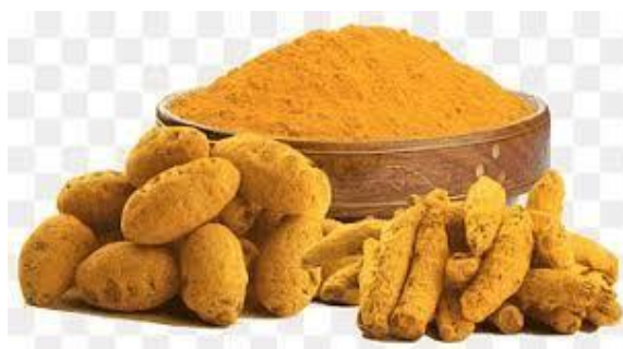
Figure no. 3 Turmeric Powder

Raw Turmeric was Obtained and dried thoroughly then grind into fine powder and later adds to charcoal peel off mask [7]