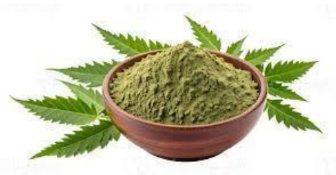
Figure no. 2 Neem Powder