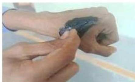
Fig no.11 (b)