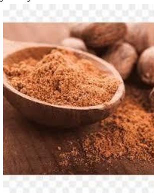
Figure no. 4 Nutmeg Powder

Biological Name : Myristica Fragrans Family : Myristicaceae