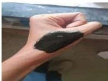
Fig no .11 (a)

Peel Off Characteristics suitable for cosmetic use, ensuring user comfort :