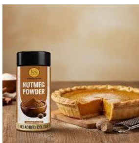
Figure No.4 Nutmeg Powder

Aloe Vera was obtained by thoroughly washing fresh Aloe vera leaves, cutting off the thorny edges, peeling away the outer green layer, and scooping out the inner transparent extracted gel. Was then filtered to remove any impurities and used in the preparation of the [9]