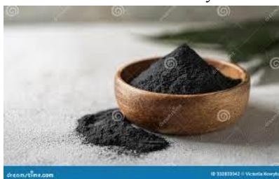
Figure no. 1 Charcoal Powder

1) The activated charcoal powder used in the formulation was directly obtained from the laboratory stock. [5]