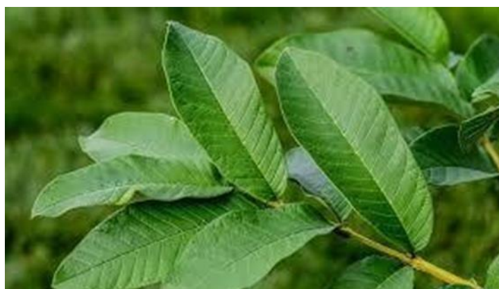
Figure 6 Guava leaves