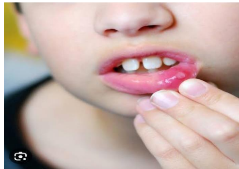
Figure 1 Minor ulcer

This are the most common (8 in 10 cases). They are small, round, or oval and are less than 10 mm across. They look pale yellow but the area around them may look swollen and red. Only one ulcer may develop but up to five may appear at the same time. Each ulcer lasts 7-10 days and then goes without leaving a scar. They are not usually very painful.