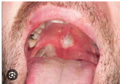
Figure 2 Major ulcer

It occur in about 1 in 10 cases. They tend to be 10 mm or larger across. Usually only one or two appear at a time. Each ulcer lasts from two weeks to several months but will heal leaving a scar. They can be very painful and eating may become difficult.