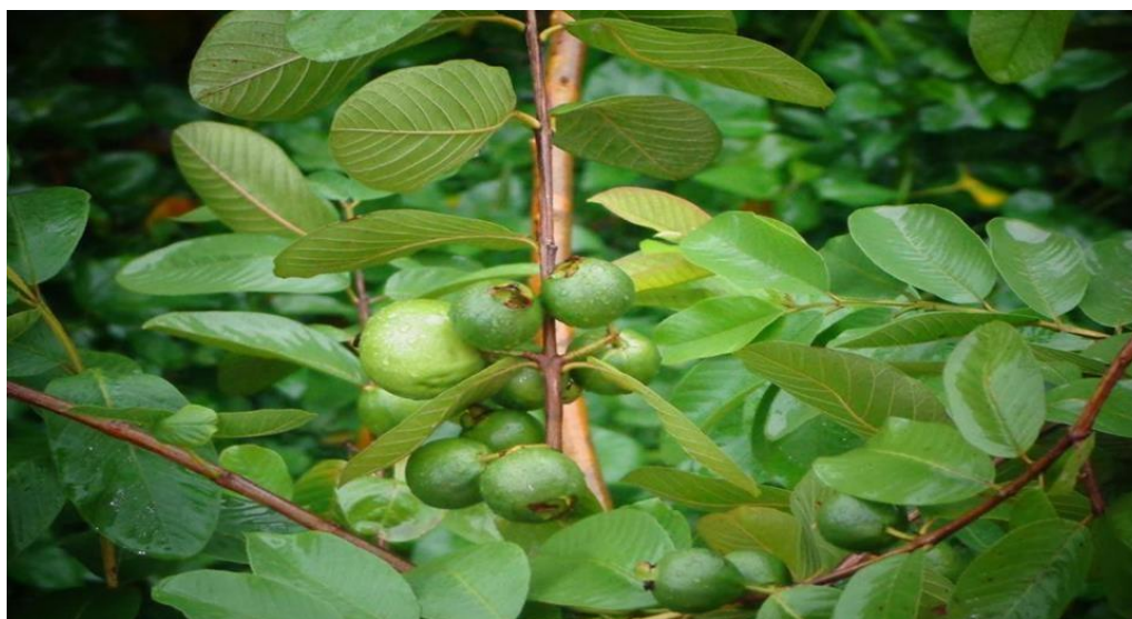
Figure 7 Plant profile

Branches: Fruit is a berry, which consists of a chubby pericarp and fleshy pulp of seed cavity