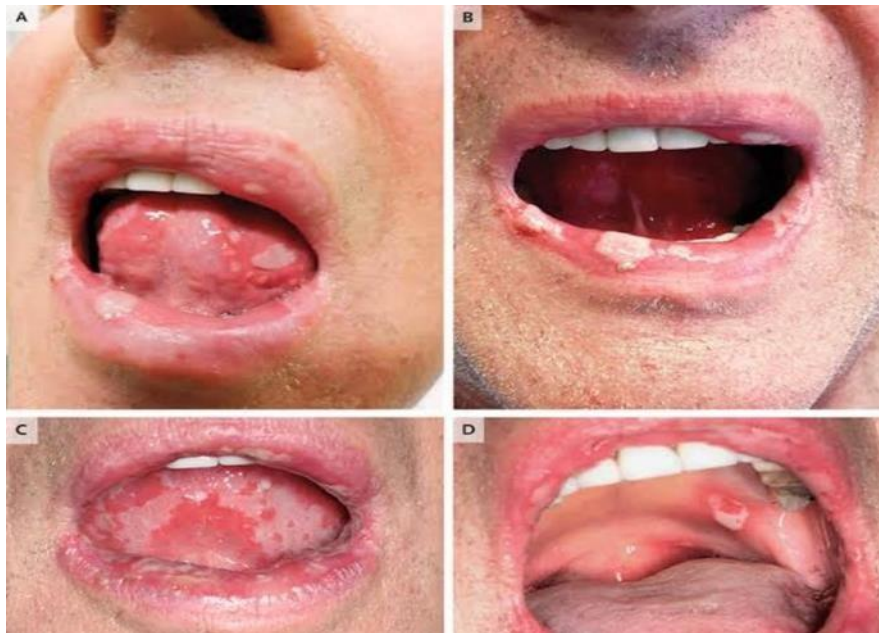
Figure 4 Types of mouth ulcers/canker sores/aphthous ulcers