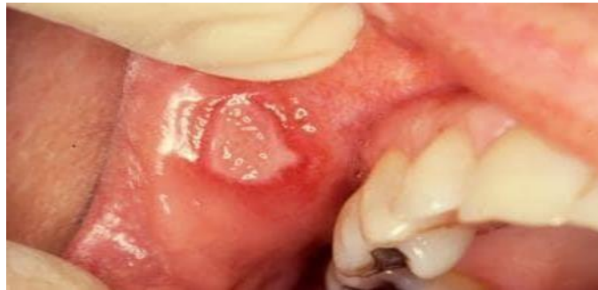
Figure 3 Herpetiform ulcer