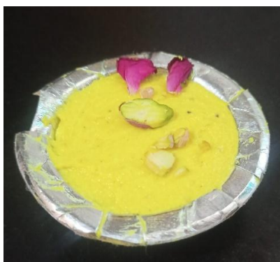
Figure 1: Makhana enriched turmeric flavoured shrikhand