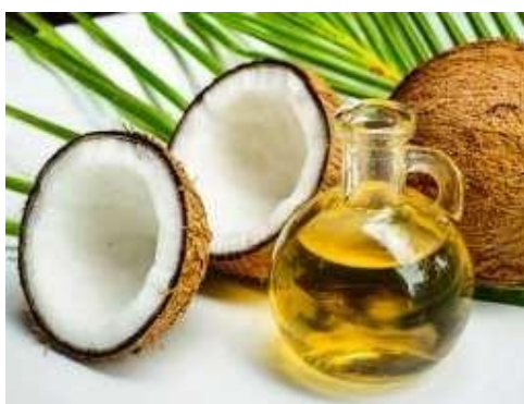
Fig.No. 4 coconut oil

It is a tropical plant that grows and is cultivated numerously by Indonesian people [21]. It contains fatty acids and is reported to possess antioxidant properties photoprotection, and other medicinal activities like anti-bacterial, skin Barrier repair, anti-aging, wound healing, and moisturizing in atopic dermatitis treatment [22-23].