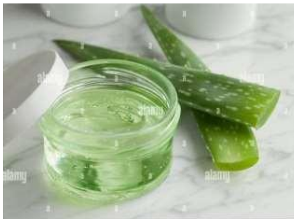
Fig. No. 5 Aloe vera

Aloe vera is a good active ingredient to reach in Sunscreen arsenal. It has been proven to both Treat and prevent burns on your skin. The leaves of aloe vera and