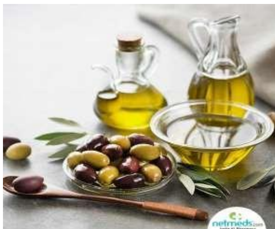
Fig. No. 3 olive oil

It is a fat derived from the olive fruit. Olive oil is made up of triglyceride esters of oleic acid and palmitic acid along with traces of squalene, sterols, (phytosterols, and tocosterols), and also consists of polyphenols like esters of s and hydroxyl tyrosol including oleocanthal and oleuropein. Some flavonoids and lignans are also present. Olive oil has been used as a home remedy for skin care. Squalene is utilized as an antioxidant, and moisturizer, and in topical sunscreen Preparation, it is a convenient vehicle to carry other substances [18,19,20].