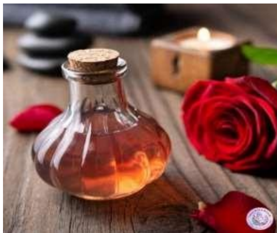
Fig. No. 6 Rose Water

It is extracted from the rose by liquid-liquid extraction [24]. One of the most important factors is that they have a good Source of antioxidant activities and also be used for beautifying purposes for their sterling sunscreen [25]. Gelatin and its hydrolysates procured from fish gelatin of tilapia ( Oreochromis niloticus ) were found to possess a Scavenging effect against reactive oxygen species of UV that renders precarious effects to the skin. It is a novel source Of components that have potential in skin anti-aging products and is also used as an emulsifying agent [26].