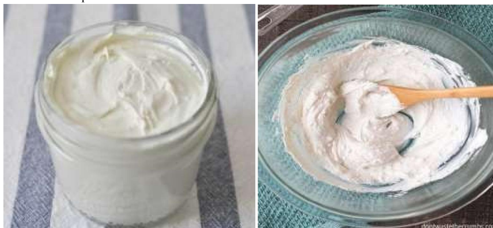
Fig. No.9 Final product

Results of our study revealed that 100% of selected herbal sunscreens are photostable in the UVB range, and 71% of Them are stable in both UVA and UVB range. Subjective study by in vivo SPF determination revealed that 98% of the Sunscreens effectively provide protection to the skin from sunburns. Overall data obtained after quality evaluation Study substantiate that all products are safe and efficacious. Total SPF obtained from formulation is 30 SPF.