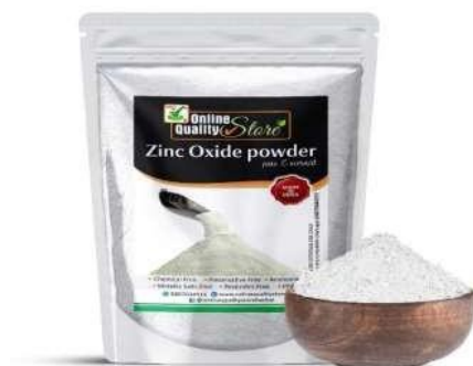
Fig. No. 2 zinc oxide powder

Oils contribute to smoothness, while rose water and aloe vera offer a light feel.