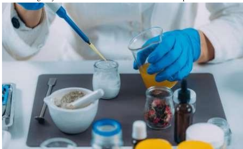
Fig No. 7 Formulation of sunscreen

Mix both the mixture and stir gently until a smooth cream is formed at room temperature.