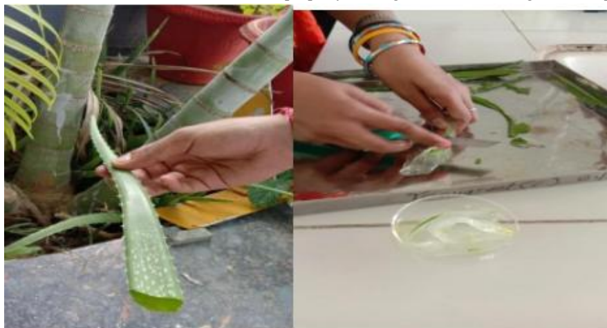
Figure5.(a)Aloe vera plant (b)Aloe vera pulp

(e) Aloe vera: Aloe vera was obtained from the garden Peel off the outer layer of aloe vera and get the pulp. Lastly aloe vera gel was obtained by grinding the pulp in a grinder. Aloe vera rejuvenates skin, moisturizes it and keeps the skin fresh all time. Aloe vera has anti-microbial property making it ideal for treating acne and pimples.