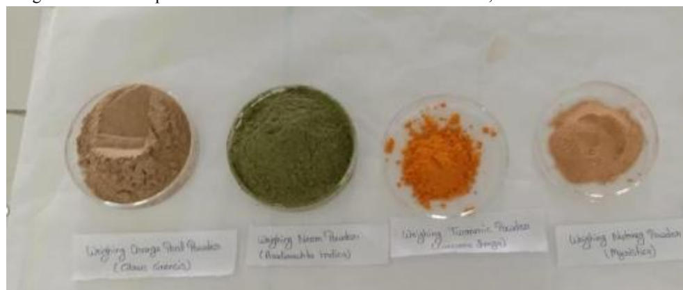
Figure 1. Ingredients used in formulation

formulation i.e., tragacanth powder, orange peel, neem powder, nutmeg powder, babool gum, turmeric powder and aloe vera were purchased from local market and also some ingredients were obtained from plants (garden). [11] The details of all ingredients used in peel off mask formulation are mentioned below;