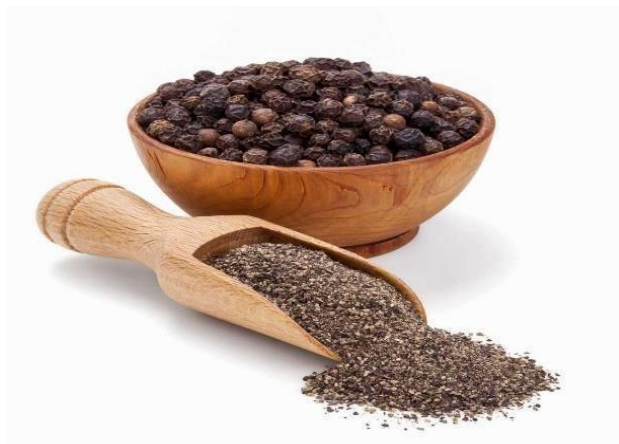
FIG NO 04. Black pepper

One broadly recognises Amla powder as a hair growth remedy. The vitamin E content in Amla enhances blood circulation to the scalp, providing hair follicles with a fresh oxygen supply. Applying Amla powder topically may help