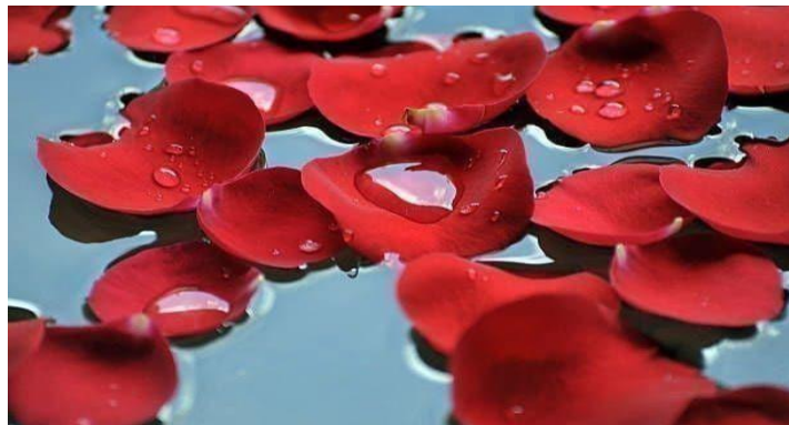
Fig No: 03 Rose Patels

Black pepper is rich in water-soluble vitamin that helps cleanse your hair, remove the dead skin and thereby keep dandruff treed. The antioxidants help the scalp get enough nourishment that's necessary for moisturizing your scalp and for balanced sebum production. Pro tip: you'll be able to buy our Scalp oil which contains black pepper.