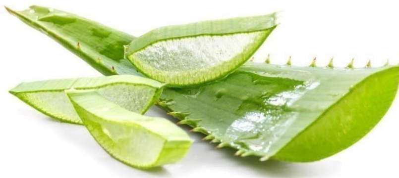
Fig No: 2 Aloe vera