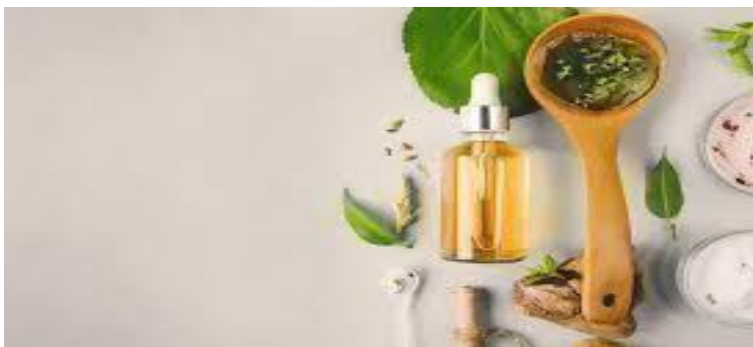
Fig No 01. Hair Serum

Hair serum is a liquid product that coats the surface of your hair. Unlike hair oil, it enhances the curliness and smoothness of the hair. Also, it smooths frizz, adds shine, and protects your hair from environmental aggressors. In addition, they are very easy to use and are typically applied after washing the hair and before styling it.