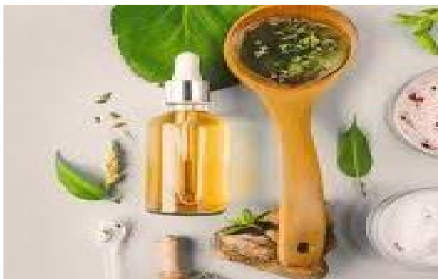
Fig No 07: Herbal Hair Serum

It has been shown that herbal hair serum provides various essential nutrients needed to preserve the proper function of the sebaceous glands and support the growth of natural hair. In the personal hygiene and health care system, the use of herbal cosmetics has changed by several folds. Therefore, the herbal cosmeceutical individual care or personal health care industry, which is actually concentrating and paying extra care on the production of herbal- based cosmetics, has a considerable clamor.