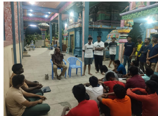
30.04.2025/NSS SPECIAL CAMP/ (5 th DAY) (i) SOLID WASTE MANAGEMENT