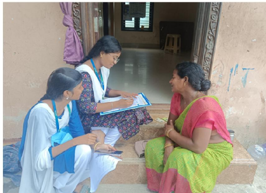
28.04.2025/NSS SPECIAL CAMP/ (3 rd DAY)