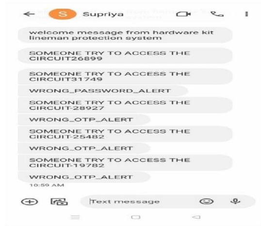
Figure 3: Alert Messages from Kit