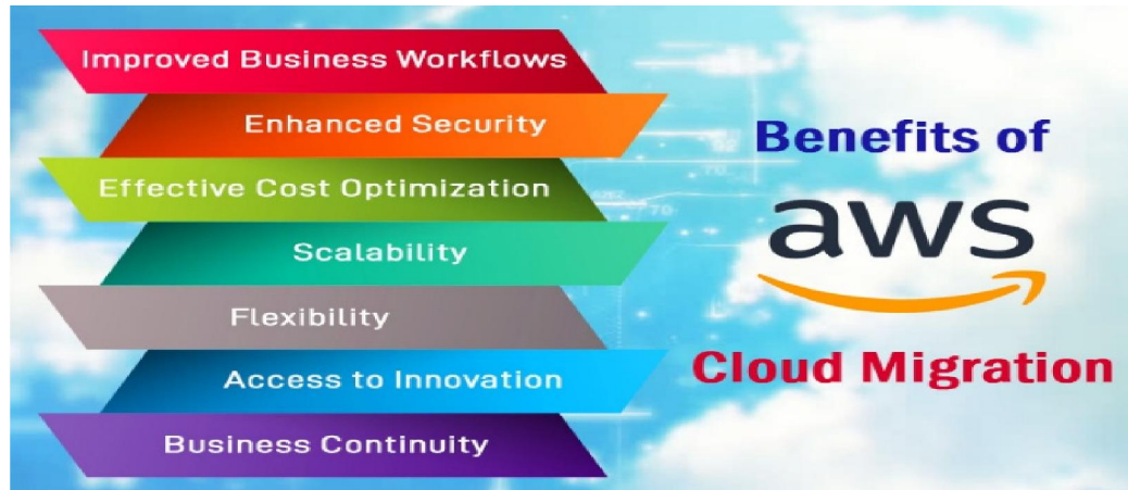
Fig 3: Benefits of AWS