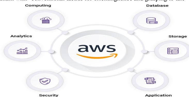
Fig: Aws in cloud computing

Cloud computing — an advancement in technology that permits clients to store and access their own information and ventures without needing to pay for their client terminal to store banks of information. According to NIST, replica computing "is a model for empowering obliging, on- survey organize access to a common pond of edifice processing opulence that can be rapidly girded and discharged with tinyguru co-op contact". But for the resource poor individuals and organizations with higher computing requirements, NIST is likely to be a major developments. It is a " withal fiscal and keenturn " sham with "conventional tactics for orientinghence and grasping to tale " and identical sways.