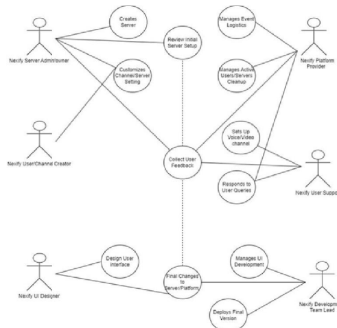
Fig. 3. Use case diagram of Nexify

The backend infrastructure is structured to handle multiple essential functions, including user authentication, real-time data synchronization, message routing, and media streaming. To ensure low-latency communication, Nexify integrates WebSockets, enabling instant data transmission without the overhead of repeated HTTP requests. Additionally, load-balancing techniques are employed to distribute network traffic efficiently across multiple servers, preventing congestion and ensuring smooth performance, even under heavy user activity.