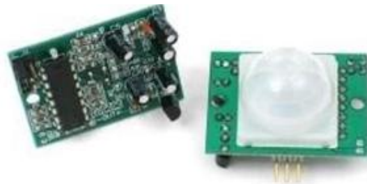
Figure: PIR Sensor

PIRs are essentially made of a pyroelectric sensor (shown below as the circular metal container with a rectangular crystal in the centre) that detects levels of infrared radiation. Everything emits some low-level radiation, and the higher the temperature, the more radiation is emitted. A motion detector's sensor is actually divided into two sections. The rationale for this is that we want to detect mobility (change) rather than average IR levels. The two sides are linked together in such a way that they cancel each other out. The output will swing high or low if one part sees more or less IR radiation than the other.