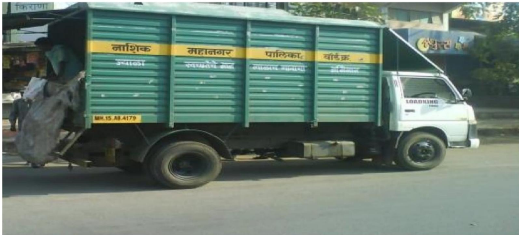
Processing of MSW