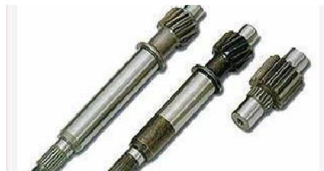
Fig. 5: Shaft used in fabrication of weeder

Shaft is made up of cast steel. It is used to support wheels and provide motion to them with the help of proper transmission system. One sprocket is attached to the shaft which receives motion from engine with the help of chain. Figure shows the view of shaft used in fabrication of weeder.