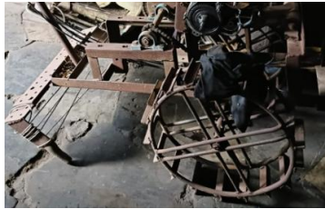
Fig. 3 Chassis Frame

Chassis is constructed from angles made up of mild steel which are cut as required length and are then welded together with the help of welding torch (Arc welding). Chassis act as a load carrying part and mounting for all the parts of machine including engine, wheels, transmission system, tools, etc. It keeps all the part assembled together.