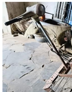
Fig. 7 Handel

Handle is used to guide the vehicle in desired direction. Also it is used to vary the speed of machine as desired as accelerator is provided on handle. Handle is designed according to human comfort in height and handling of machine. There is a single wheel attached to the machine. This front wheel is attached below the chassis.