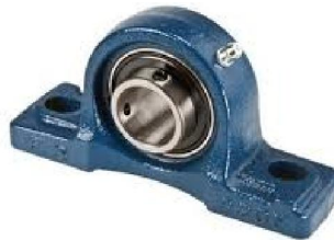
Fig. 4 Bearing Pedestal

A bearing pedestal, also known as a bearing housing, is a component that supports a bearing and provides the necessary structural support and protection. It is designed to hold the bearing securely in place and often includes features such as mounting holes, seals, and lubrication channels to ensure the proper functioning of the bearing.