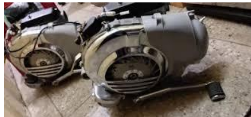
Fig.1: Two Stroke Petrol Engine

In fabrication of power weeder, engine is the most important component. For this project we used a 2 stroke petrol engine. The figure of the engine is shown below: