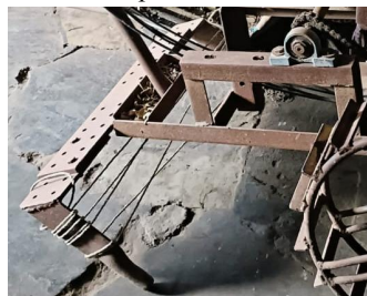
Fig. 2 Weeder Tool

The figure of the weeder tool used in fabrication of the power weeder is shown below