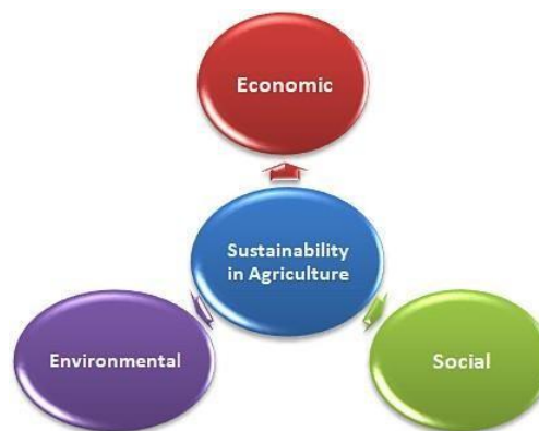
Fig. 5: Dimensions of sustainability in agriculture

The accomplishment of agricultural activities with the help of drones required less amount of time, less labour intensive and increase the farmers' safety while working. The time saving, improved level of safety and reduction in labour requirement in profession along with the respect in society will help in achieving the social dimension of sustainability in agriculture. 6