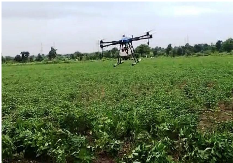
Fig. Chemicals spraying on cultivated crops using drone technology.

Drone technology has the potential to transform agriculture by providing an alternative to manual calamities, and delivering medicine to remote areas during health emergency. 11 In agriculture, drones digital technology to modernize the agriculture The researchers conducted a field study to explore sector. The farming community is showing a positive the application of drone technology in agriculture. approach towards the use of drone technology Figures 1 and 2 are the pictures captured from in agriculture because of two reasons that are the the field. absence of labour and the increasing importance of precision farming. 10