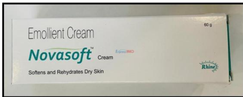
Image No. 5 Use of Emollient Cream

An help you to break the itch and scrape cycle with a 24 hour moisturizing action. using very hot water when you bathe or shower