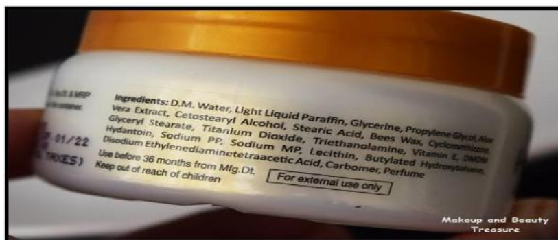
Image No. 4 General Ingredients of Emollient Cream