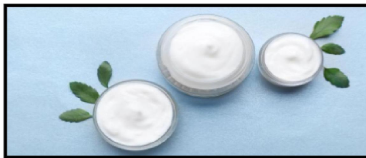
Image No. 3 Emollient Cream

Although numerous people suppose an emollient and a moisturizer are the same thing, they aren't. An emollient is one of the constituents in a moisturizer. The other constituents in a moisturizer bring water into your skin. Emollients are the part of a moisturizer that keep your skin soft and smooth.