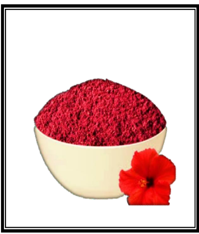
Fig 6: HIBISCUS

Uses - Hair growth stimulant, antibacterial.