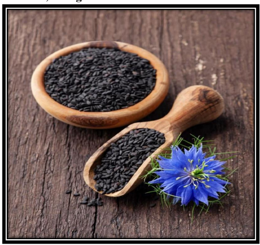
Fig 4: NIGELLA SATIVA

Uses - Anti-inflammatory, anti-oxidants, hair growth Stimulator