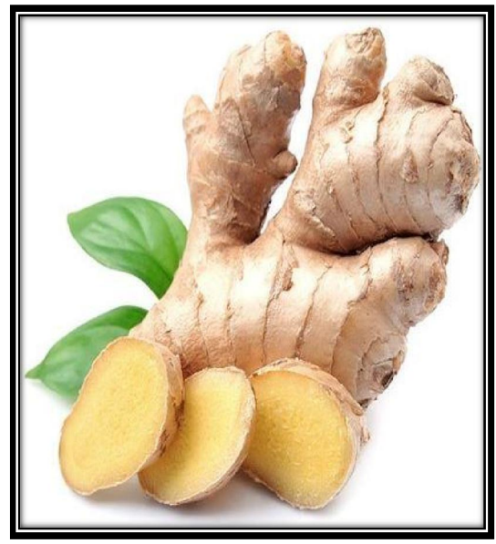
Fig 2: ZINGIBER OFFICINALE

Uses - Anti-oxidant, anti-inflammatory, Orange oil as