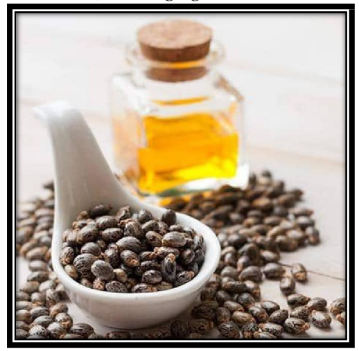
Fig 7: CASTOR OIL

Uses - Hair growth stimulator, anti-dandruff, colouring Agents.