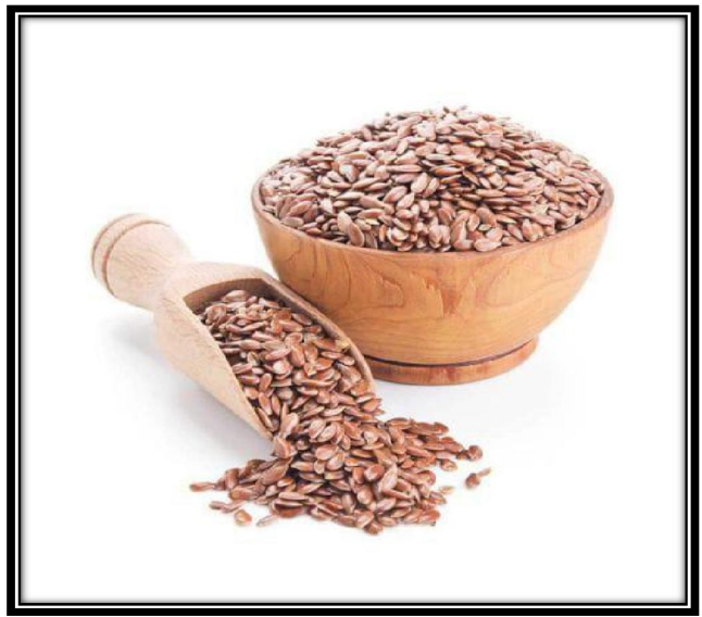
Fig 3: LINUM USITATISSIMUM

Ginger- Ginger (Zingiber officinale) is traditionally used to prevent hair loss and stimulate hair growth. Several Companies produce shampoos containing ginger extract that they claim prevent hair loss and promote hair growth