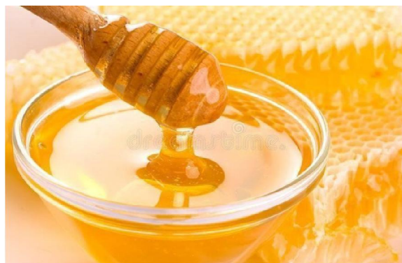
Fig: 6 Honey

Synonyms -madhu, madh, mel, purified honey