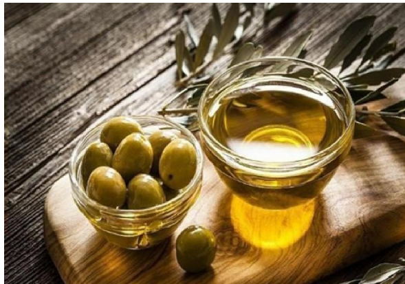
Fig 5: Olive Oil

Synonyms Oleum olivae, Sweet oil, Salad oil.