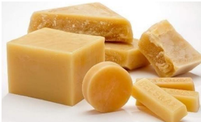
Fig 2: Bees