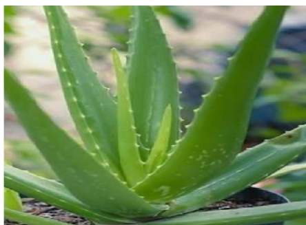
Fig 3: Aloe Vera