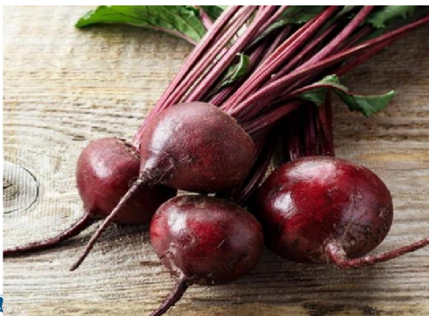
Fig no. 4 Beet Root DOI: 10.48175/568