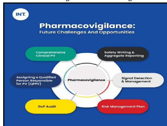
Fig.3. Future Challenges and Opportunities in Pharmacovigilance