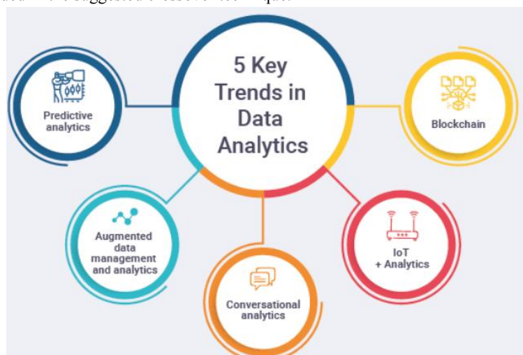
Figure 2: Data Analytics