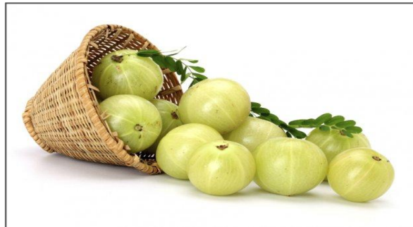
Fig No.2 Emblica Officinalis

Well, you must be wondering how gooseberry can be used to your skin. You can consume it with honey or you can also apply it on your skin directly and reap its benefits. If you are finding it hard to consume this sour fruit, then try making juice out of it and consume it. This will do good for your skin. Here are some health benefits of gooseberry for your skin.