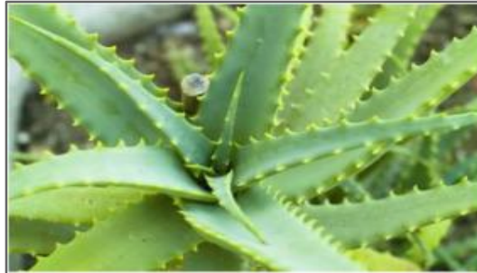
Fig No.1 Aloe Barbadensis

polysaccharides, nitrogen and other components that make it a miracle beauty herb. Some of the most important applications of Aloe vera for purpose of Cosmetology are being explained here briefly.