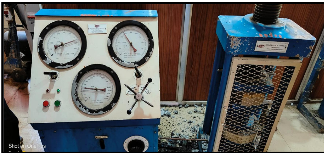
Fig2. Paving block Testing