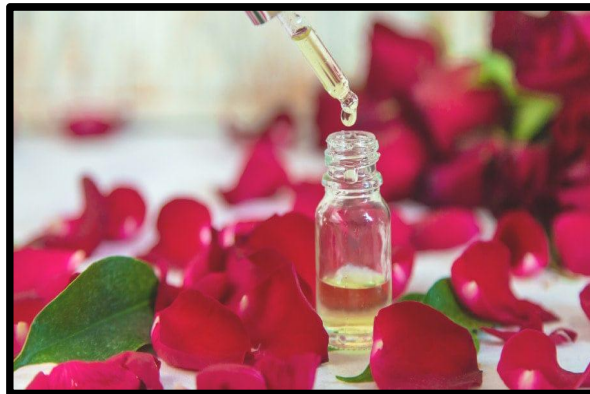
Fig-8 Rose oil

Rose oil, extracted from rose petals, has various uses