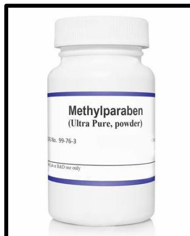
Fig-8 Methylparaben DOI: 10.48175/568

Methyl paraben is a widely used preservative in various industries