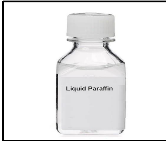
Fig -7 Liquid paraffin

Liquid paraffin, also known as mineral oil, has various uses across different industries