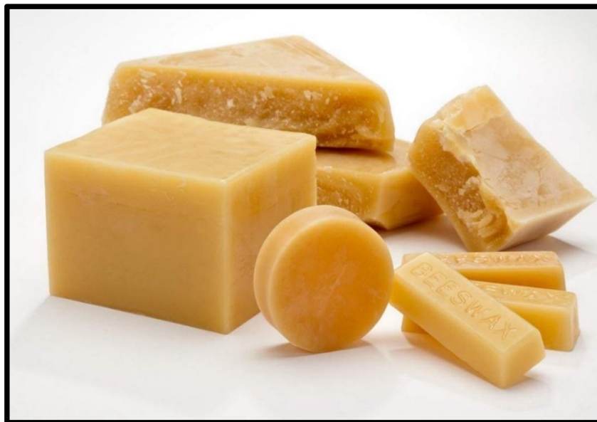
Fig-6 Bees wax