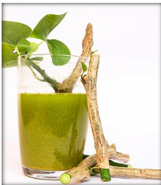
Fig 1.3 Herbal Juices