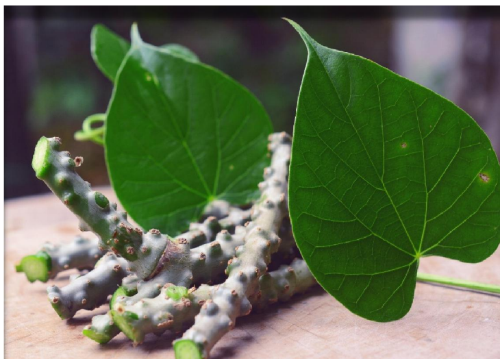
Fig 1.1 Tinospora Cordifolia

Herbal formulations are medicinal preparations consisting of one or more herbs in specified quantities, intended for cosmetic purposes, diagnosis, or to mitigate diseases in humans or animals. Also known as botanical medicine or phytomedicine, herbal medicine was the primary system of medication in the early twentieth century, prior to the availability of antibiotics and analgesics. With the advent of allopathic medicine, known for its fast therapeutic action, the popularity of herbal medicine declined. For instance, Curcuma has been used in Traditional Chinese Medicine for over two thousand years due to its anti-inflammatory properties and robust antioxidant effects. Despite the rise of synthetic drugs, approximately 70–80% of people continue to use herbal medicine as their primary healthcare due to its fewer side effects and better compatibility with the human body. Herbal medicine has gained renewed interest and is considered more effective in certain aspects compared to synthetic drugs.