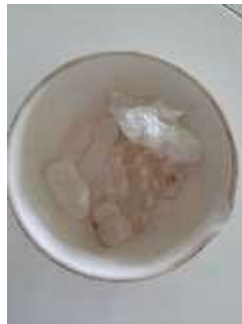
Fig 3: Hard paraffin

Used to increase hardness of the formulation