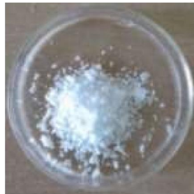
Fig 4: Cetostearyl alcohol

It is used to maintain the consistency of the formulation.