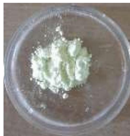
Fig 5: White soft paraffin

It act as both emollient and protective in the formulation