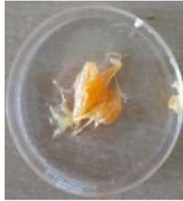
Fig 2: wool fat