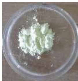
Fig 6. Sublimed sulphur