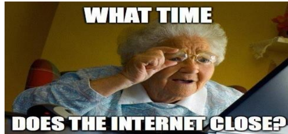
Figure 2: Meme from media

Even though the meme and the quatrain are simple, it questions a big community and also gives information about the quality of education to the critics. This is a best example to depict, ‘Literature through memes.’ Let’s take another example.