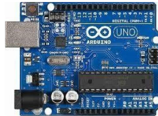
Figure 3: Arduino UNO

Arduino reference plan employments Atmega 8, 168 or 328. Show models utilize ATmega328. The stick arrangement is appeared underneath. Greatest dimensions of Uno are 2.1x2.7 inches. USB and control jack connectors are expanded exterior the prior estimation. The board can be connected to base Four screw gaps are given. Hole between the pins 7 and 8 is 0.16".