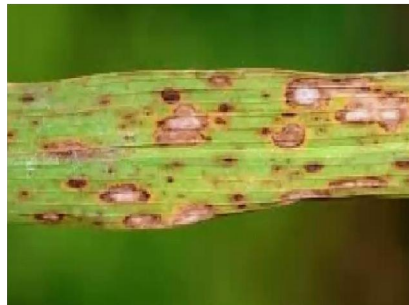
Figure 6: Diseased Leaf Image