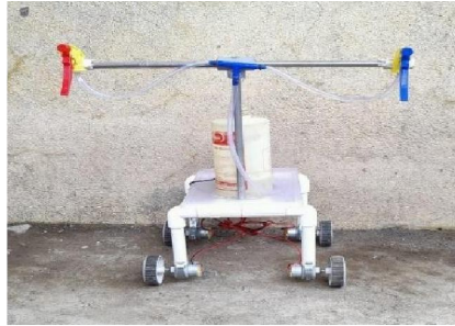
Figure 5: Pesticides Sprayer Robot