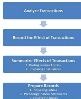
Fig. 2. Process of accounting

Figure 2 depicts the typical accounting process speed. The four main steps are the evaluation of Sales, outcomes documentation, and document processing are all examples of tasks. This is a balanced approach that guarantees the processes can be employed both manually and technically.