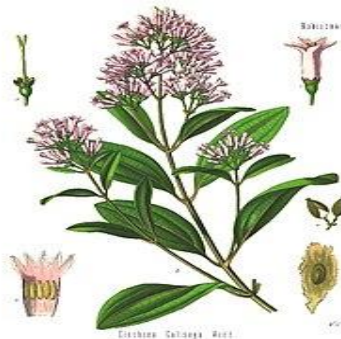
Fig 2:- taxonomical classification of cinchona

Part used:- bark Kingdom:-Plantae Clade:- Tracheophytes Clade:- Angiosperms Clade:- Eudicots Clade:-Asterids Order:-Gentianales Family:-Rubiaceae Genus:- Cinchona Species:-C.officinalis