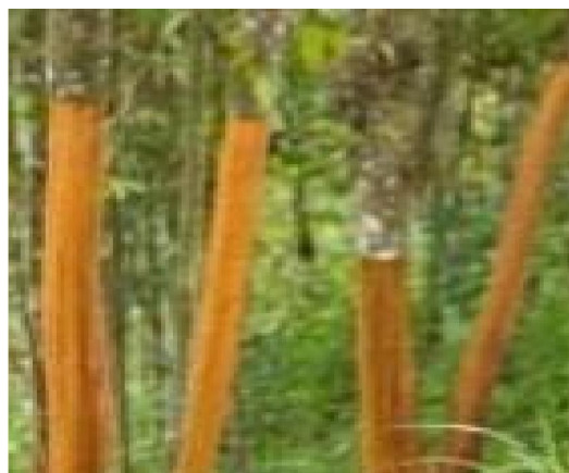
Fig 4:-Taxonomical Classification of Cinnamon

Kingdom:-plantae Division:-Magnoliophyta Class:- Magnoliopsida Copyright to IJARSCT www.ijarsct.co.in