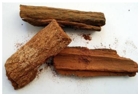
Fig 1. cinchona

Synonyms:- Jesuits bark, Peruvian bark, Cinchona, Cortex Cinchonane.