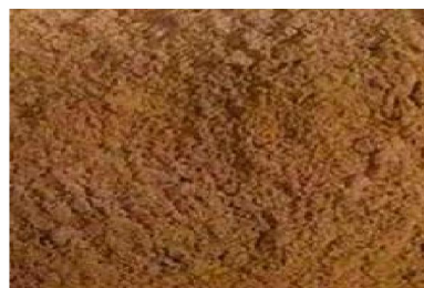
Fig 6:-Cinchona powder