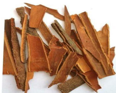
Fig 7:- Cinnamon bark