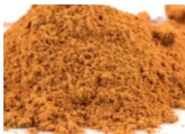
Fig 8:- Cinnamon powder