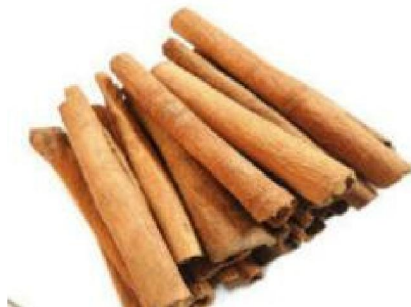
Fig 5:-Cinchona bark