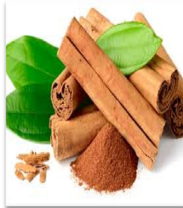
Fig 3 :- Cinnamon

Synonyms:- Cinnamon bark, Kalmi- Dalchini, Ceylon Cinnamon.