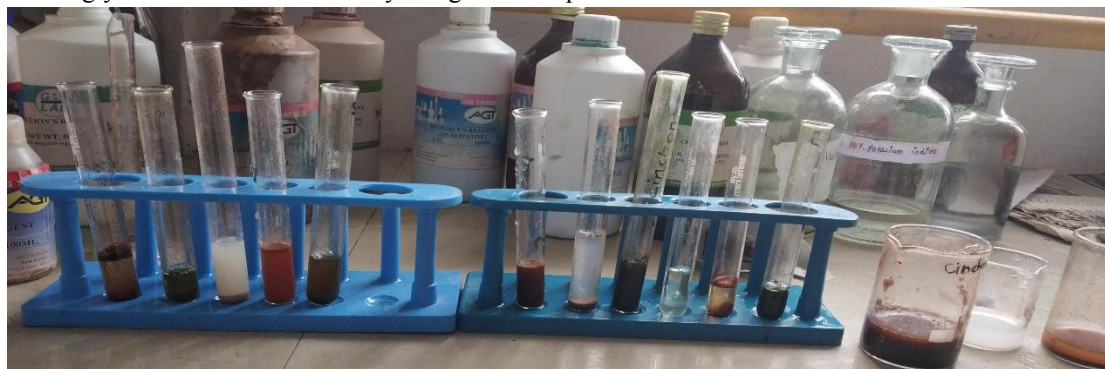
Fig 11 :- preliminary test

By performing the preliminary Phytochemical analysis on various fraction detect presence of various chemical constituent by performing chemical organic confirmatorytest for alkaloids, flavonoids, tannins, saponoids, phenols, terpenoids and glycosides was carried out by using standard procedure.